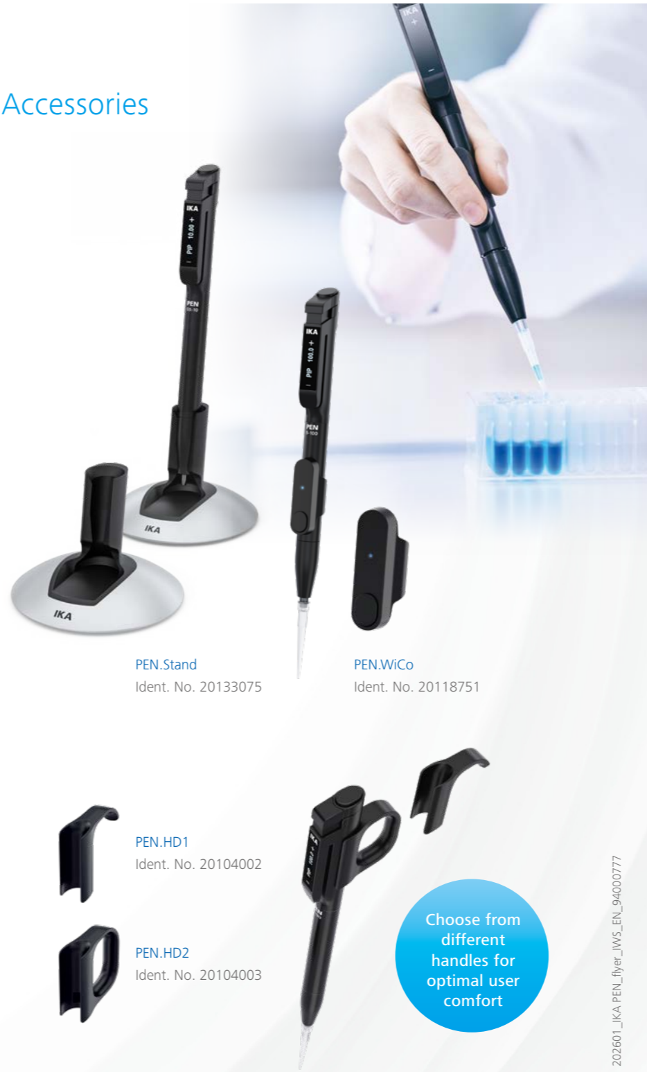
PEN.Stand Ident. No. 20133075